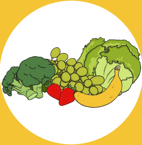
Fruit and vegetables